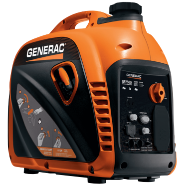
Model 7118-0 UPC: 696471069303