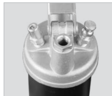
Aluminium die cast head with bulk loader and air bleeder valve