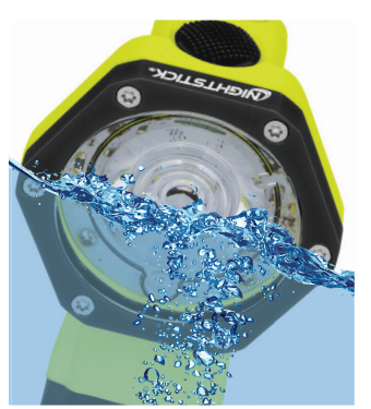
Chemical, impact and IP-67 waterproof/dustproof for use in extreme environments